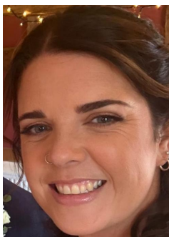
Meg Co Chair

It promises to be a fun-filled evening, so don't miss out. Tickets are now on sale — see the poster for full details.