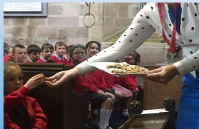
Presentation of Holding Crosses